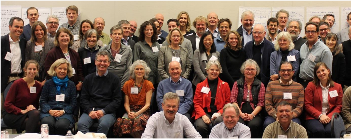
Participants in the ILCN Workshop on Cross-Border Collaboration (P

conservation activities, then please email Emily Myron at emyron@lincolinst.edu .