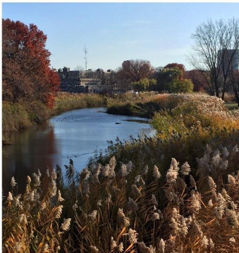
One of the measures that passed was the Community Preservation Act in the City of Boston, Massachusetts, which will use a property tax surcharge to create new funding for affordable housing, historic preservation, and parks.

According to the Land Trust Alliance, land trusts led and contributed to 12 of these campaigns , and the Trust for Public Land was engaged in 31 of these campaigns . Success was achieved in both democrat- and republican-leaning states and districts, showing that land conservation is still an issue that voters overwhelmingly agree is important.