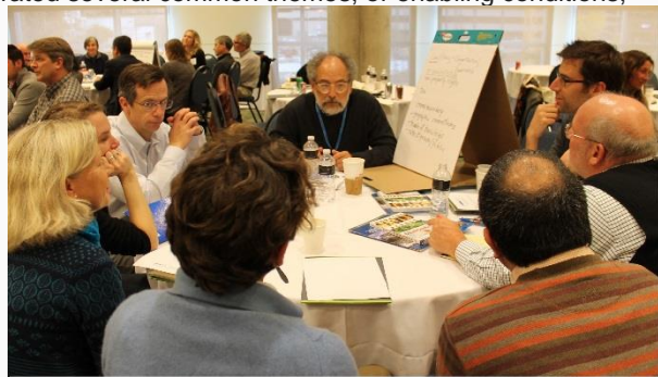
Participants discuss enabling conditions for cross-border collaboration in private land conservation

The ILCN will work to explore these common themes and challenges in greater depth in order to provide the community with new resources and educational opportunities that may support further cross-border efforts and knowledge sharing.