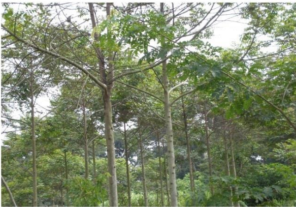
An indigenous woodlot

A cornerstone of ECOTRUST's work has been mobilizing communities to form communal land associations (CLAs), which are registered legal entities. These CLAs may then obtain ownership of local lands and develop management plans, thus empowering communities to improve their natural resources.